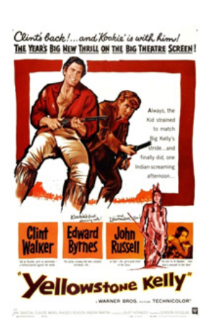
1959 Warner Brothers film "Yellowstone Kelly"

and the West. When older soldiers refused to carry mail between outposts fearing attack by Sioux warriors, Kelly volunteered. Kelly wandered the river valleys looking for game and hostile Indians.